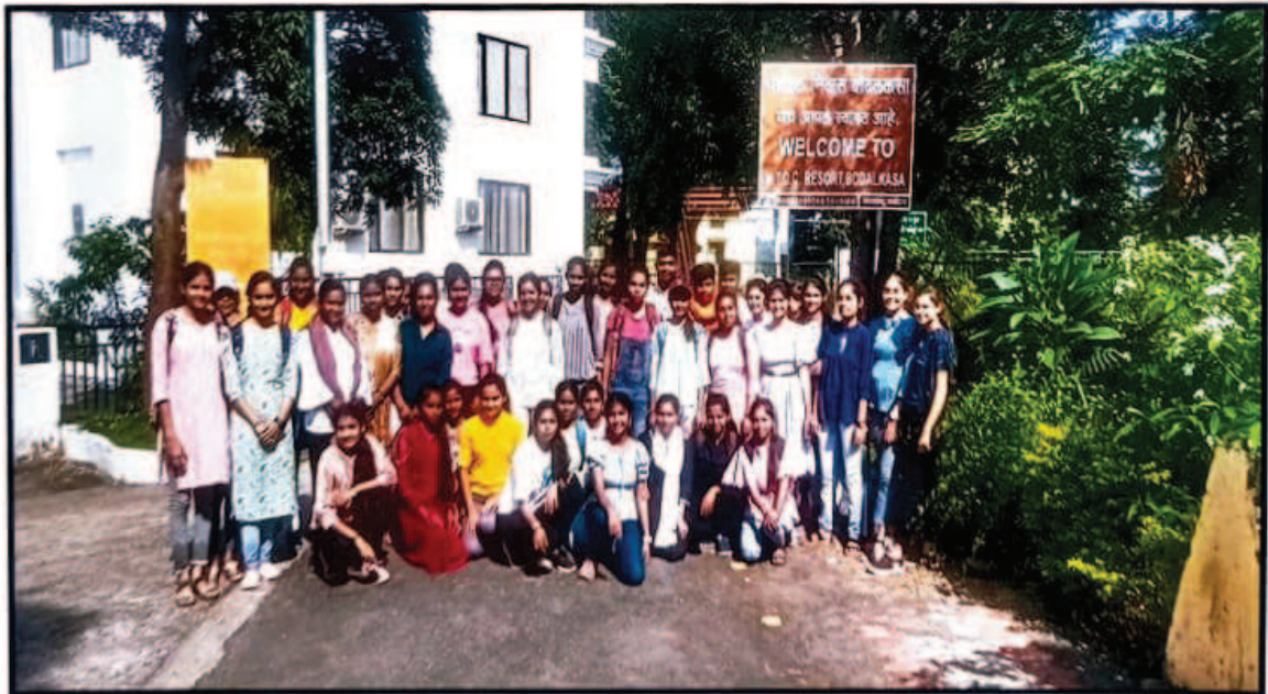
Students at Bodalkasa Forest and Dam Rest House