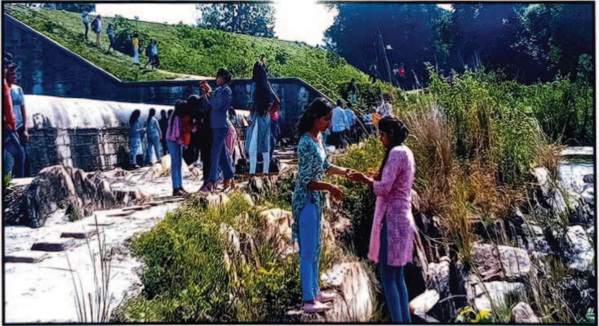
Students at Bodalkasa Dam area