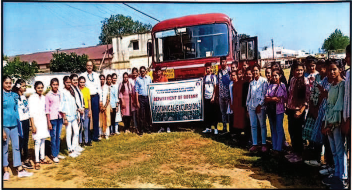
Students about to leave to Bodalkasa Forest Area