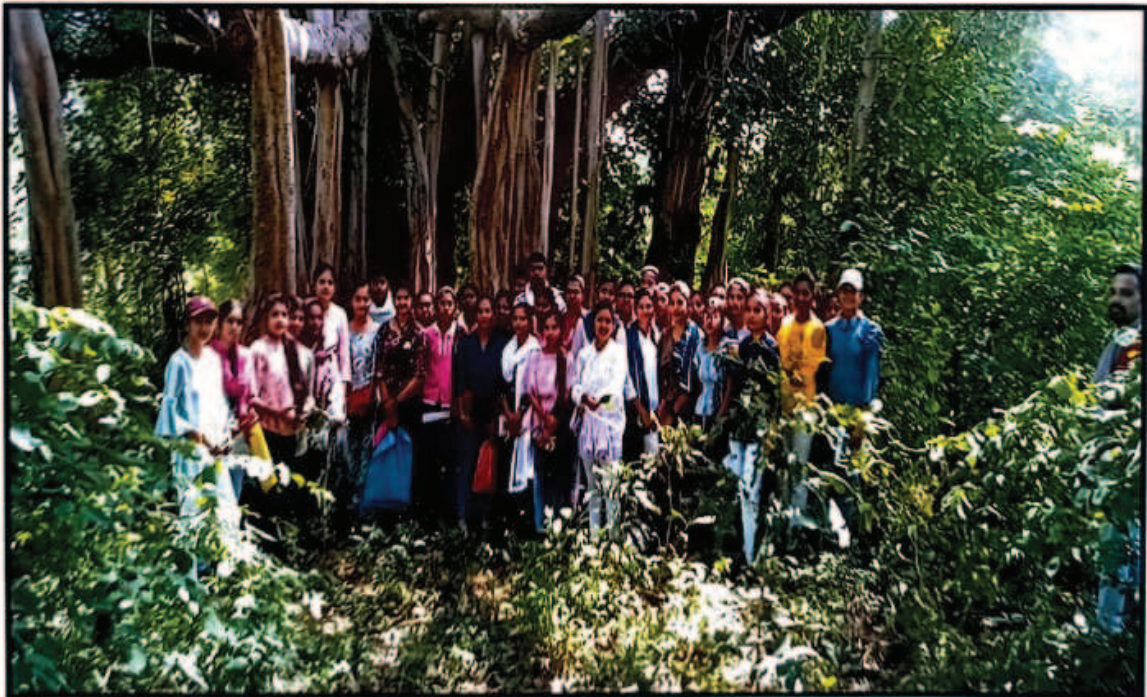
Students at Bodalkasa Forest Area