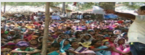
Public Meeting for non-violence, Damrancha, Aheri