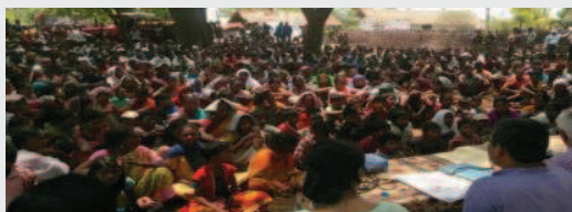
Public Meeting for development, Nelgonda, Bhamragad