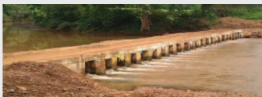
Bablaie Mata Bridge, Juvi Nala Bhamragad