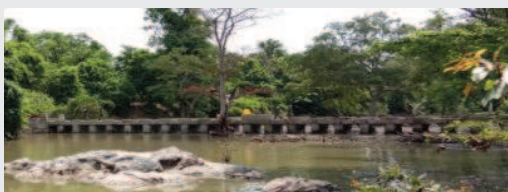
Bhimsetu Bridge, Yeramnar, Aheri